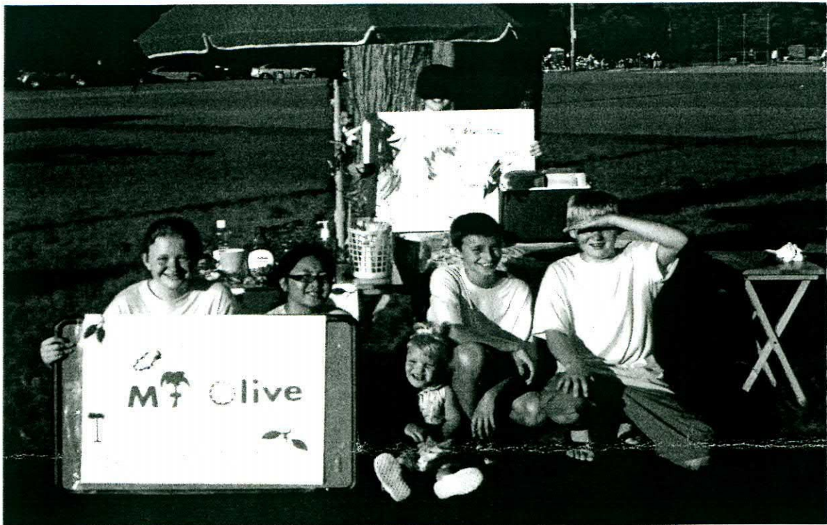
LemonAID Group Shot!